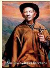
San Jose Gabriel Brochero

The local Catholic newspaper wrote of him: "It is known that Fr. Brochero contracted the sickness that took him to his tomb, because he visited at length and embraced an abandoned leper of the area."