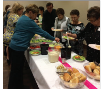
The Ladies Altar Society held their February Luncheon/Meeting on Tuesday, February 5 th.