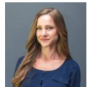
The Best Compliment is a Referral